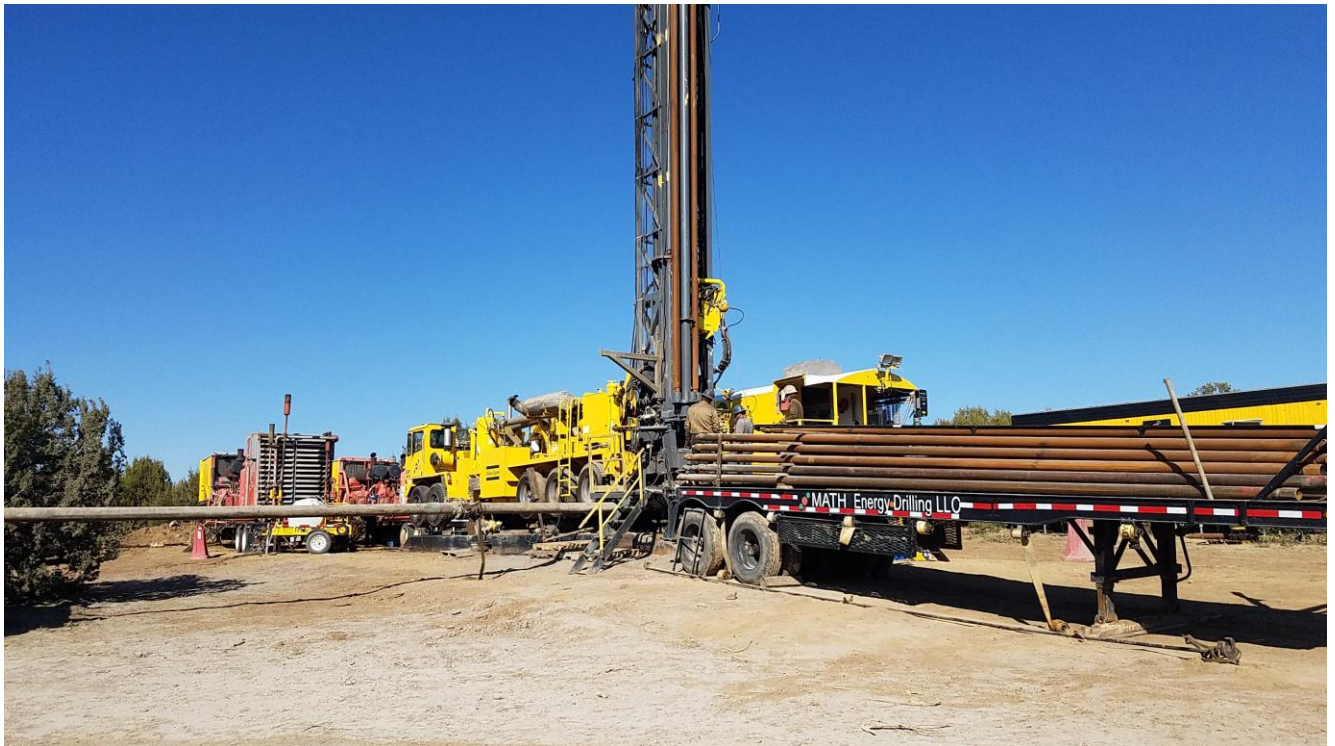
Figure 1: Amerigo Vespucci #1 drilling operations

Regular operational updates will be made on drilling and the fracture stimulation program.